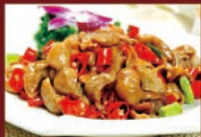
泡椒肥肠 £ 18.80/份 Pork Intestine with Pickled Peppers