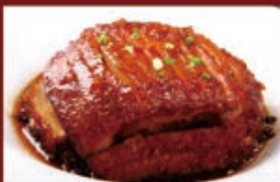
梅菜扣肉 £16.80/份 Braised Pork with Preserved Vegetables