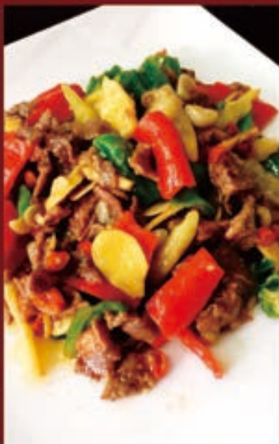
泡椒牛肉 £ 16.80/份 Beef with Pickled Peppers