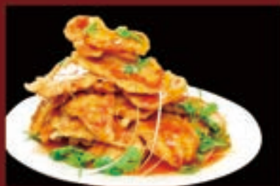
东北锅包肉 £13.80/份 Fried Pork in Scoop