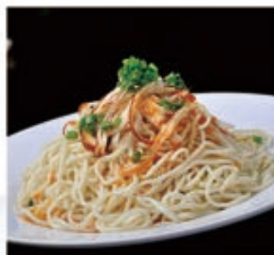
凉拌鸡丝面 £8.80/份 Shredded Chicken with Cole Noodles