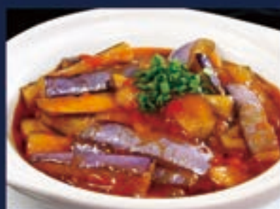
鱼香茄子 £10.80/份 Fish-Flavored Eggplant