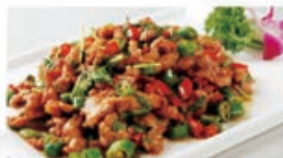
小炒羊肉 £15.80/份 Stir Fried Lamb