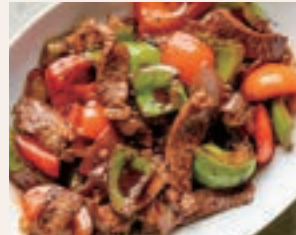
豉椒牛肉 Stir - fried Beef with Black Bean Sauce