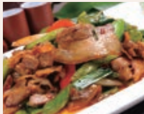
回锅肉 Twice Cooked Pork Belly with Pepper