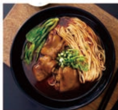
猪脚面 £13.80/份 Pork Knuckle Noodle Soup