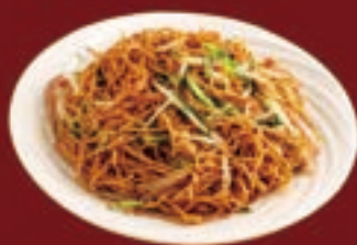
净炒面 £6.80/份 Plain Chow mein