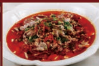
酸菜豆花肥牛 £ 18.80/份 Beef with Chinese Sauerkraut and Tofu Pudding