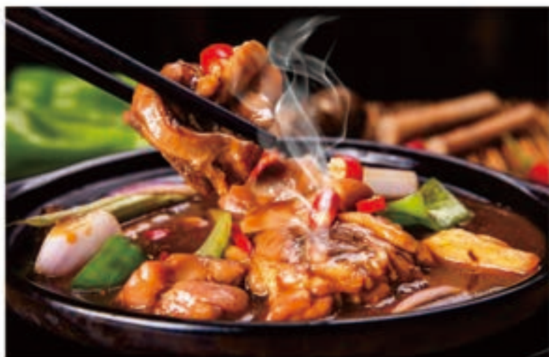
黄焖鸡 £ 15.80/份 Braised Chicken