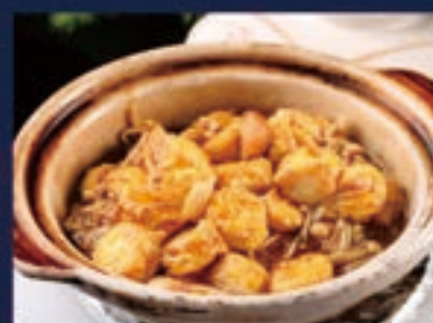
北菇玉子豆腐煲 £13.80/份 Mushroom and Japanese Egg in Clay Pot