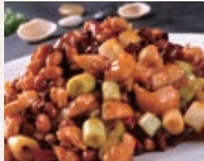
宫保鸡丁 Kung - Po Chicken with Peanuts