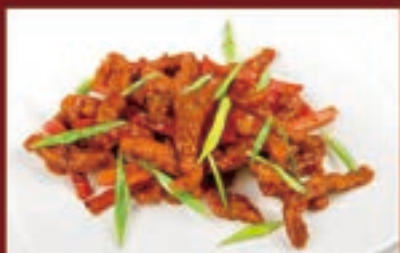
干炒牛丝 £13.80/份 Stir Fried Shredded Beef