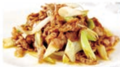
葱爆羊肉 £15.80/份 Lamb with Scallion