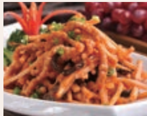
鱼香肉丝 Shredded Pork in Szechuan Chilli Sauce