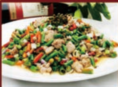
鲜椒兔 £ 23.80/份 Rabbit with Fresh Peppercorn