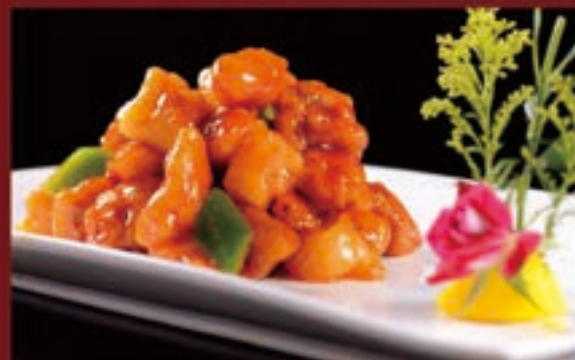
咕咾鱼片 £15.80/份 Sweet & Sour Fish Fillet