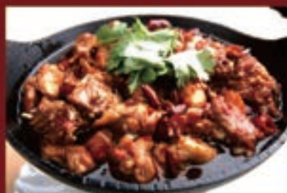
香辣干锅兔 £ 23.80/份 Spicy Griddle Rabbit