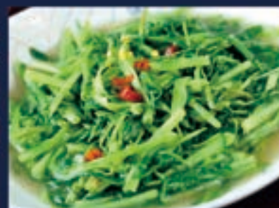
腐乳通菜 £13.80/份 Stir-fried Water Convulvulus with Preserved Beancurd