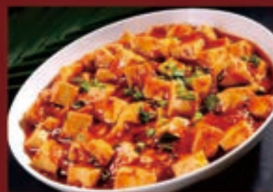
麻婆豆腐 (素) £12.80/份