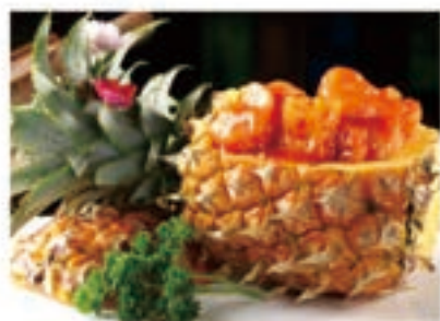
菠萝石榴古老虾球 £14.80/份 Sweet and Sour King Prawn with Pineapple and Pomegranate