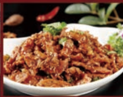
孜然牛肉 £14.80/份 Beef with Cumin