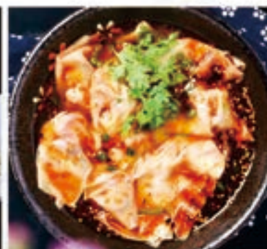
红油抄手 £8.80/份 Dumplings in Chili Oil