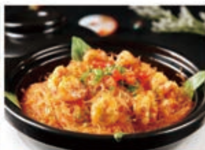
XO酱虾球粉丝煲 £16.80/份 King Prawn with Vermicelli and XO Sauce in Clay Pot