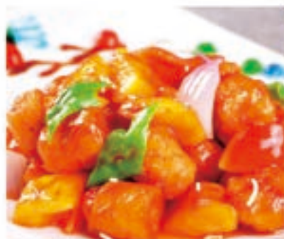
菠萝石榴古老鸡 £ 12.80/份 Sweet and Sour Chicken with Pineapple and Pomegranate