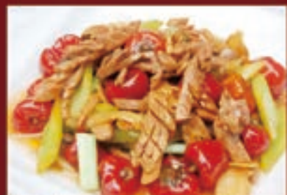
泡椒腰花 £ 18.80/份 Pork Kidney with Pickled Peppers