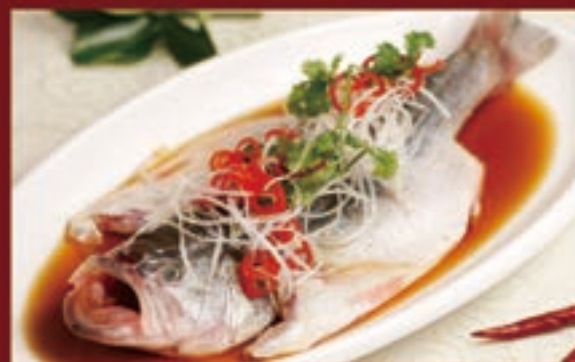
清蒸鲈鱼 £23.80/份 Steamed Seabass