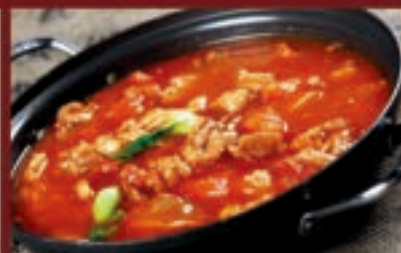
番茄炖牛腩 £16.80/份 Stewed Beef Brisket with Tomatoes