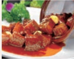
毛氏红烧肉 Mao's Braised Pork