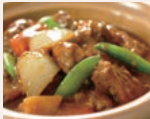
咖喱牛肉 Beef Curry