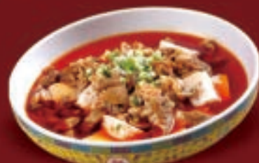
酸菜豆花肥肠 £ 18.80/份 Pork Intestine with Chinese Sauerkraut and Tofu Pudding