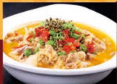
酸汤肥牛 £ 18.80/份 Beef with Sour Soup