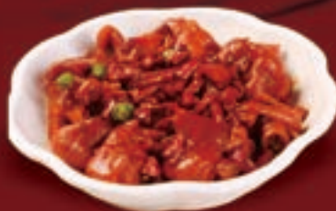
香辣美客蹄 £ 15.80/份 Spicy Pork Trotter