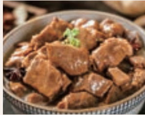
红烧牛腩 Braised Beef Brisket