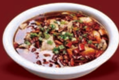
水煮肉片 £15.80/份 Boiled Pork in Hot Sauce