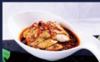
传统口水鸡 £ 9.80/份 Traditional Chicken with Chilli Oil Sauce