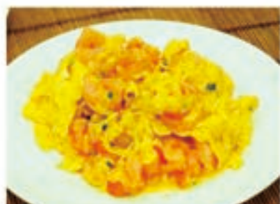
滑蛋虾球 £14.80/份 Scrambled Egg with King Prawn