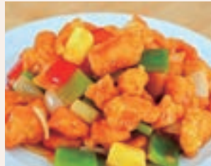
菠萝咕嚕鸡 Sweet & Sour Chicken with Pineapple