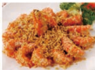
金沙虾球 £17.80/份 King Prawn with Salted Egg Yolk