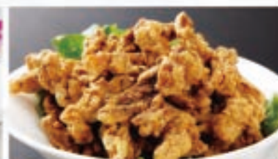
家乡小酥肉 £12.80/份 Crispy Pork