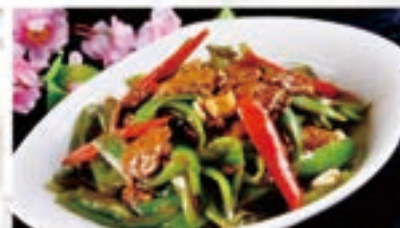
鲜椒小炒肉 £12.80/份 Pork with Pepper