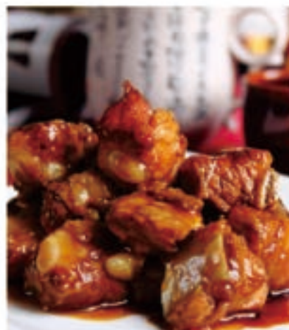
镇江排骨 £12.80/份 Sweet & Sour Spare Ribs