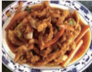
干炒牛丝 Sautéed Hot Shredded Beef