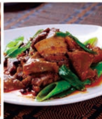
传统回锅肉 £13.80/份 Traditional Cooked Sliced Pork