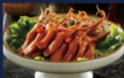
麻辣鸭舌 £ 9.80/份 Spicy Duck Tongue