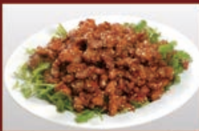
孜然羊肉 £15.80/份 Lamb with Cumin