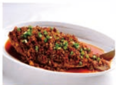
干烧鲈鱼 £25.80/份 Dry-Braised Seabass