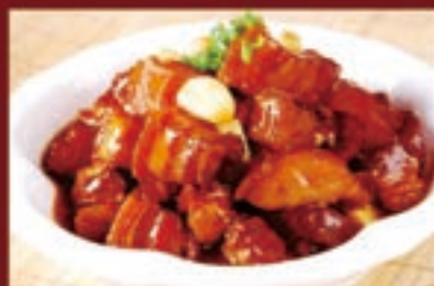
毛氏红烧肉 £15.80/份 Mao's Braised Pork