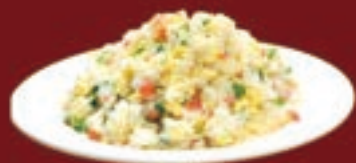
蛋炒饭 £4.80/份 Egg Fried Rice