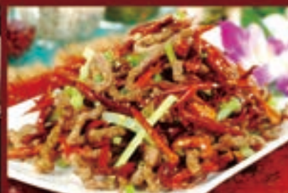
干煸牛肉丝 £ 16.80/份 Dry-Fried Shredded Beef