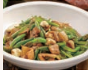
尖椒炒肉 Stir-fried Pork with Chilli Pepper