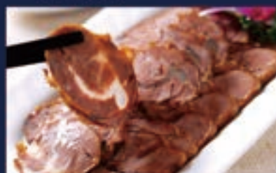
酱牛肉 £ 9.80/份 Braised Beef with Soy Sauce