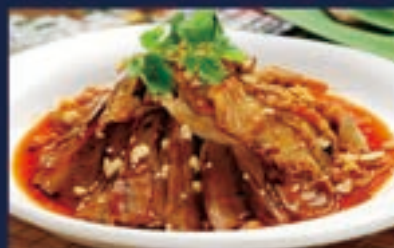
夫妻肺片 £ 10.80/份 Sliced Beef and Ox Tongue in Chilli Sauce