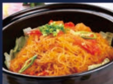
XO 酱粉丝煲 £12.80/份 Vermicelli with XO Sauce in Clay Pot