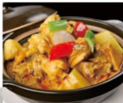
咖喱鸡 £ 12.80/份 Chicken Curry