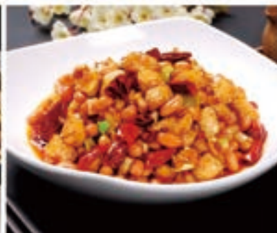
宫保鸡丁 £ 13.80/份 Kung Po Chicken