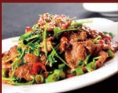
小炒黄牛肉 £15.80/份 Stir Fried Beef