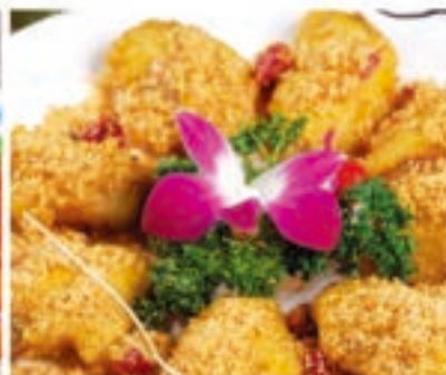
金沙鸡翅 £ 13.80/份 Chicken with Salted Egg Yolk