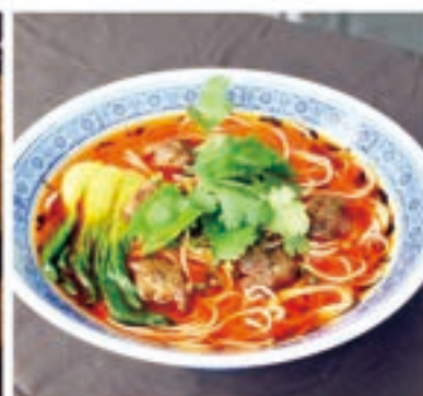
红烧牛肉面 £14.80/份 Braised Noodles Ramen