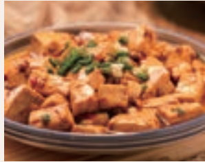
麻婆豆腐 (V) Ma Po Tofu