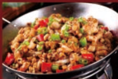
干锅牛蛙 £ 23.80/份 Griddle Bullfrog