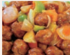
菠萝咕嚕肉 Sweet & Sour Pork with Pineapple

(All dishes comes with rice and cold dish or starter)