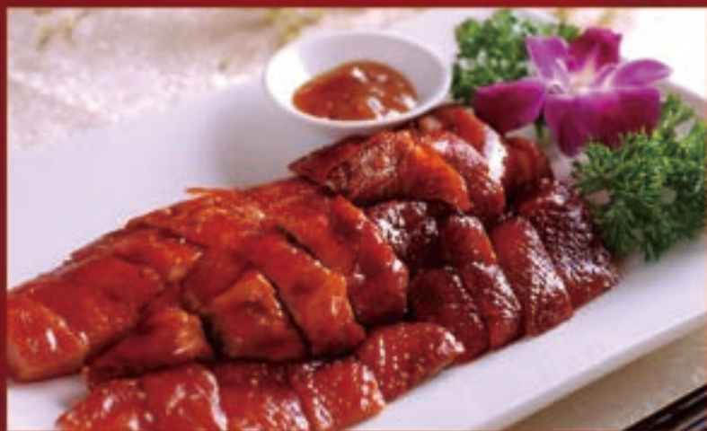
烧鸭 1/4 £ 9.80/份 Roast Duck (1/4)