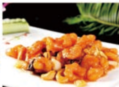
宫保虾球 £14.80/份 Kung Po King Prawn